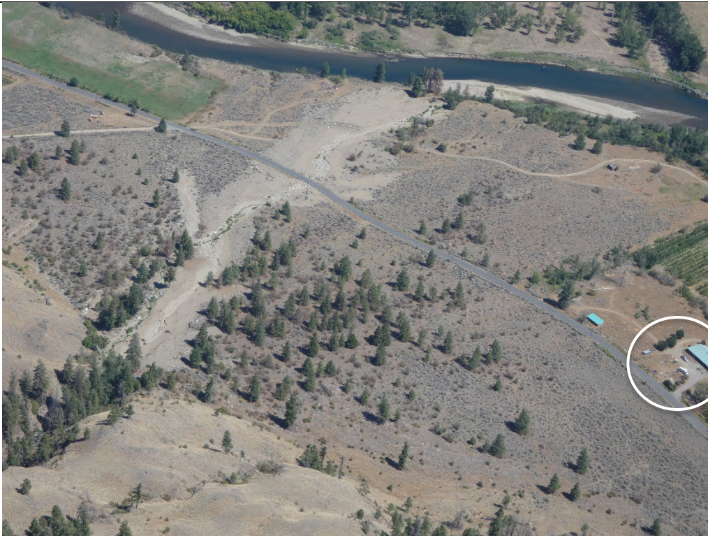
Photo 7: View north showing Robert (aka Moonshine) Creek fan area. Note evidence of May 2023 flood event, nearby residences (circled) and Chopaka Road. Similkameen River is in the background.