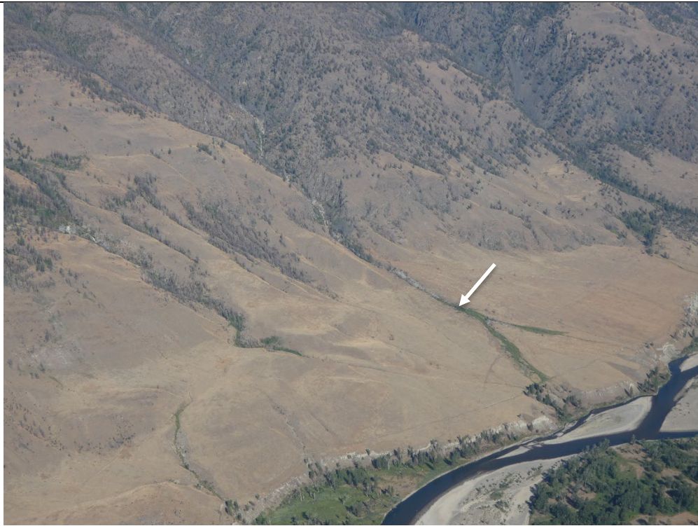
Photo 9: View north showing Sintelhahten Creek fan area (arrow) and other small tributaries. Note Chopaka Road north access road (faint, unpaved trail).