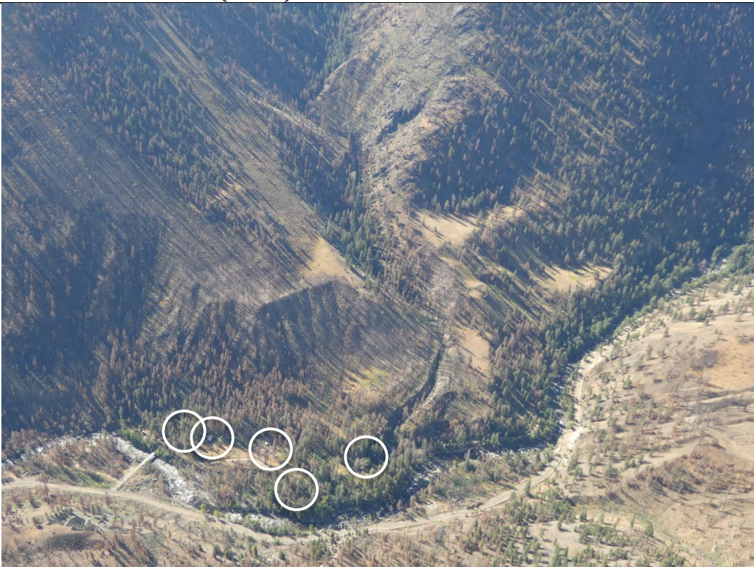
Photo 2: View south to fan area of Webster Creek. Note bridge crossing Ashnola River from Ashnola Road to Ewart Road. Residences (approx.) along Ewart Road are circled.