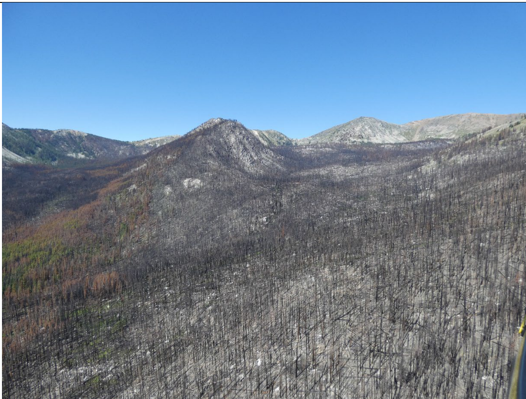
Photo 4: Burned headwater area within the Snehumption Creek watershed.