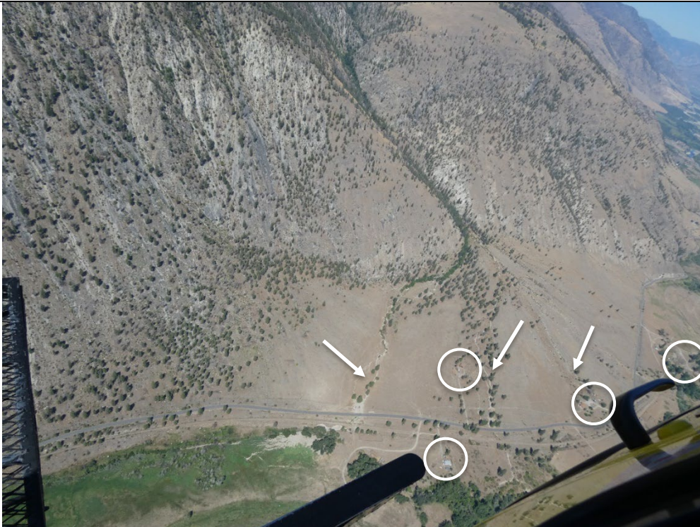
Photo 6: Shoudy Creek fan area showing multiple channels (arrows) that experienced recent sediment-laden flooding events resulting in impacts to Chopaka Road. Note residences (circled).