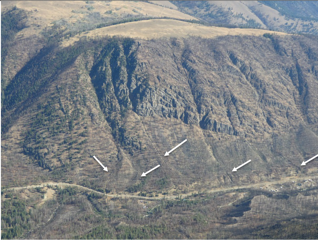
Photo 1: Small tributary gullies and face unit slopes on north side of Ashnola River. Post-wildfire surface erosion and sediment-laden flows are visible (arrows).