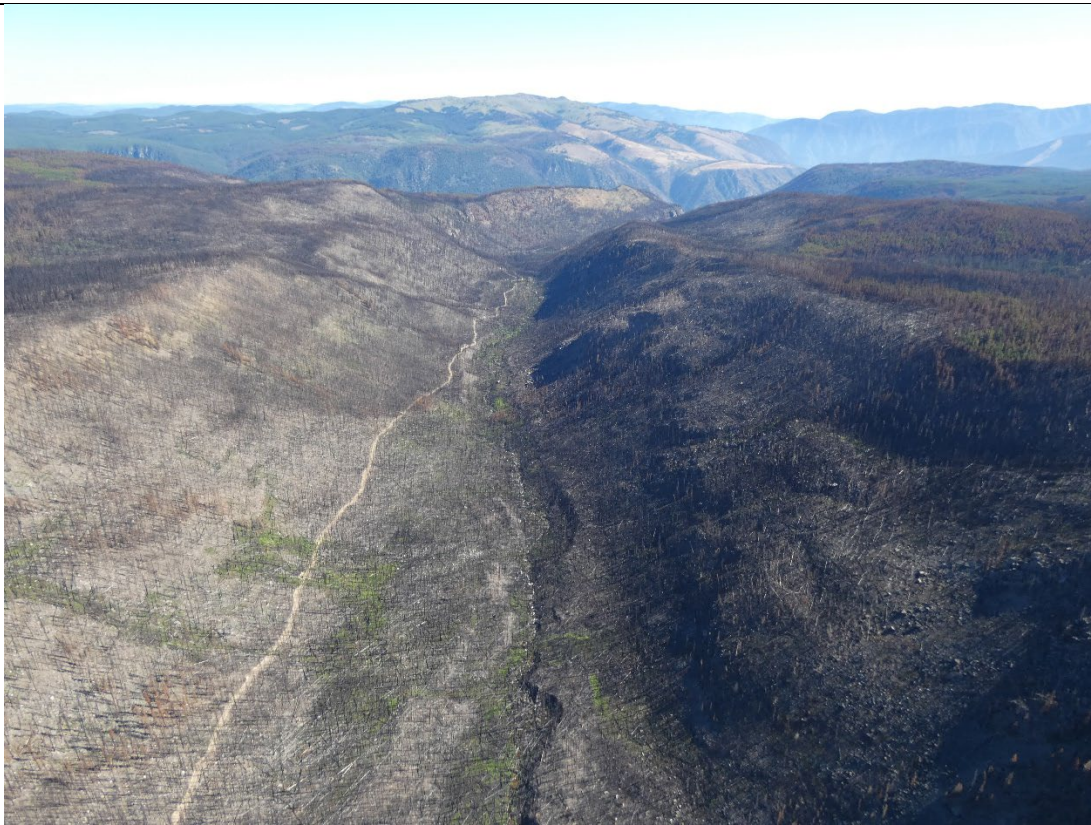
Photo 3: View north (downstream) along Lakeview Creek with access road to Cathedral Provincial Park visible on the left.