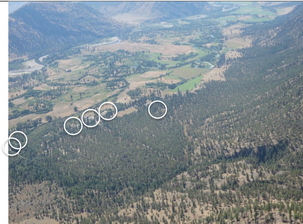
Photo 5: View south-east showing Snehumption Creek fan area. Note residences (circled) and access along Chopaka Road.