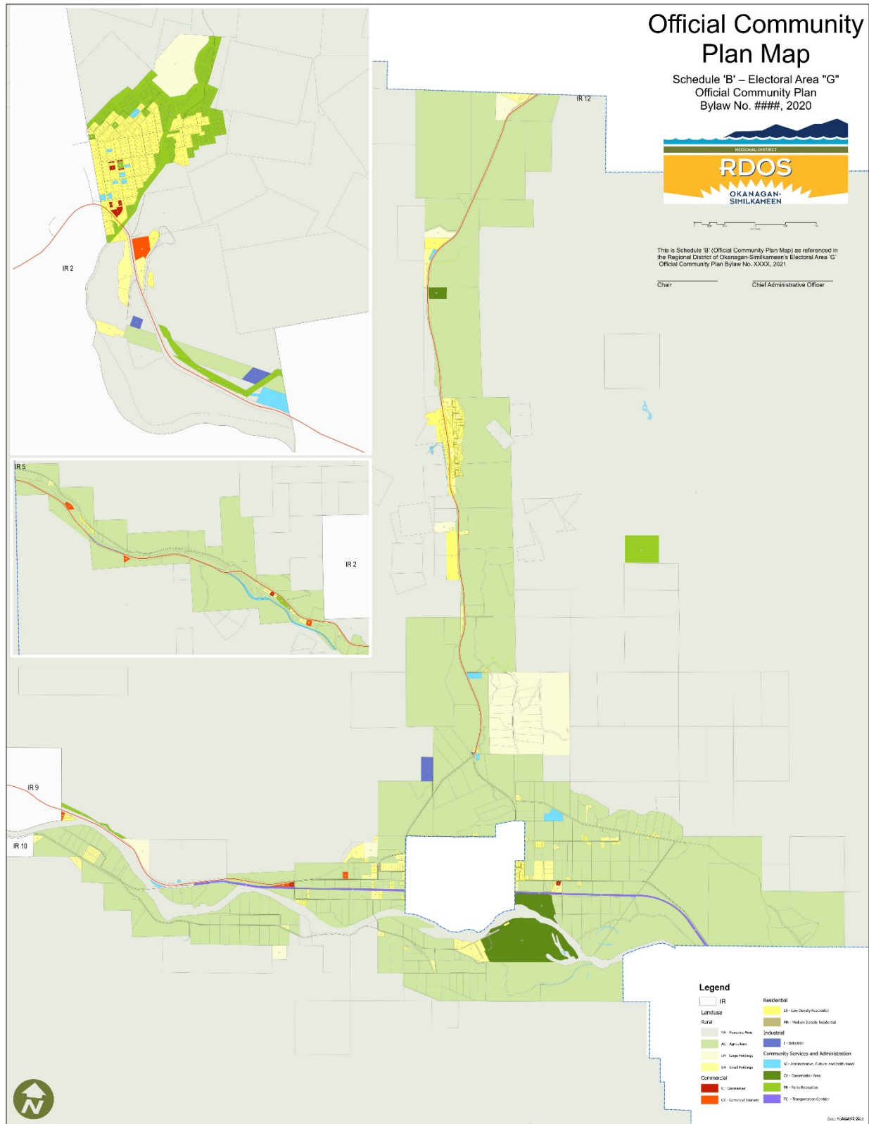
Figure 1: a draft land use map and designations for Electoral Area "G". Note: Land use is not zoning. Land use designations outline what the land is used for, it doesn't regulate what to build and how (that's a zoning bylaw).