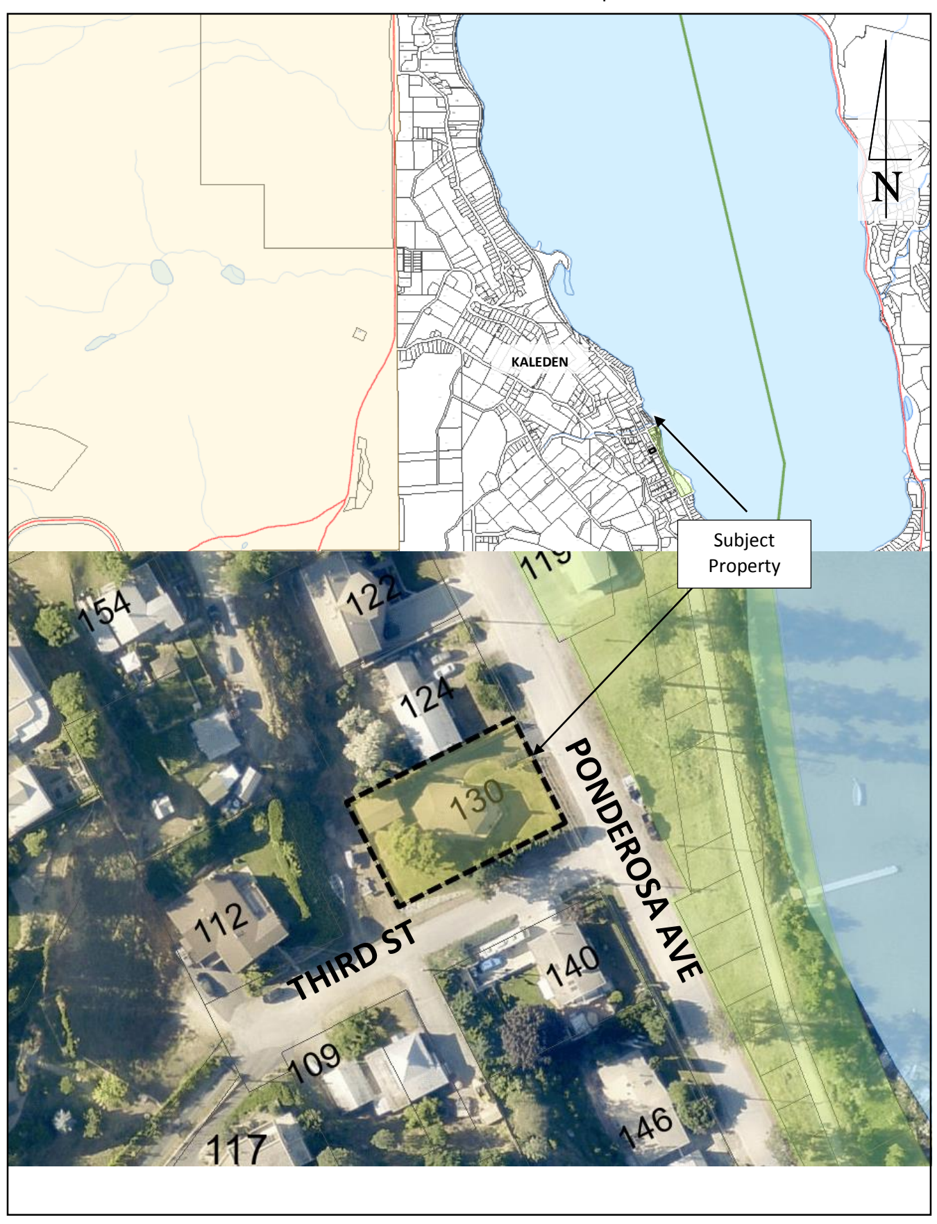
Attachment No. 1 – Context Maps